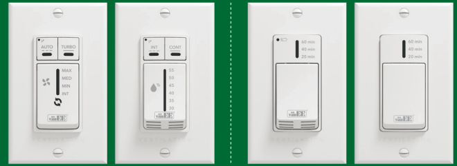
Automatic Control 41304